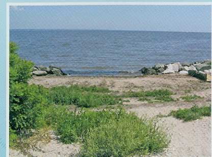
Holland Point Park