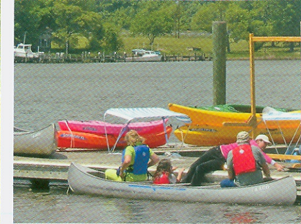
Quiet Waters Park