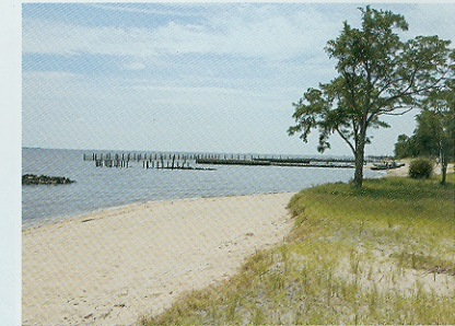
Mayo Beach Park