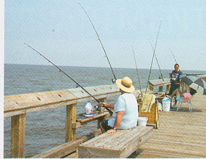
Downs Park Fishing Pier