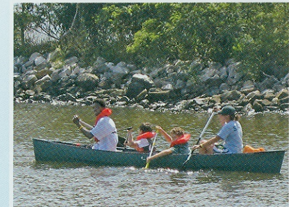
Fort Smallwood Park